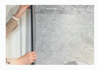
Step 5: Fit trims for a seamless finish