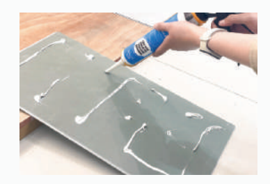
Step 3: Apply adhesive evenly to the back