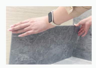
Step 4: Press panels firmly onto the wall