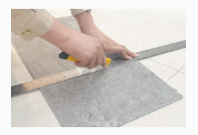
Step 2: Cut panels to size with a utility knife