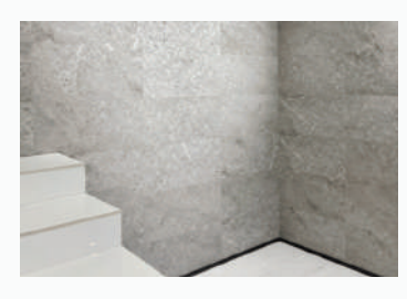
Step 5: Installation complete — enjoy your space!